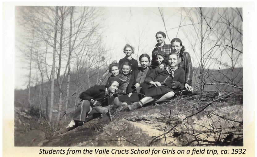
Students from the Valle Crucis School for Girls on a field trip, ca. 1932