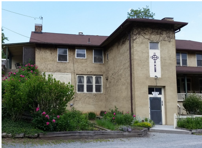
New Celtic Cross graces the Annex door panel, May 2016

Finally, we're eagerly awaiting the arrival of the North American Academy of Pipe & Drum , which kicks off five weeks of classes beginning June 19th. We welcome the music of bagpipes back to the High Country. Here's hoping we'll welcome YOU back to Valle Crucis soon, too!