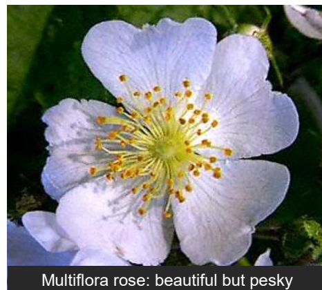
Multiflora rose: beautiful but pesky

Multiflora rose, or baby rose, Japanese rose, or seven-sisters rose, is an attractive nuisance. First cultivated as an ornamental, for erosion control, and as a living fence, it forms dense thickets that invade pastures and crowd out native species, even preventing birds from nesting with its thick, thorny growth. Even more pernicious is Fallopia japonica , or Japanese knotweed, that is taking over the riparian border along the creek. Newsweek Magazine reveals the extent of knotweed's murderous nature: "It presents a pleasing appearance to the eye: heart-shaped leaves, bamboo stems and pretty, little white-flower tassels. What is less obvious is this plant's relentless killer instinct. Look through the horticultural literature, and you will see it described as 'thuggish,' 'ferocious,' 'invasive,' and an 'indestructible scourge.' And where once it resided mainly in the wild, today it terrorizes private gardens and homes." ( Newsweek , 7/5/2014). Track hoes, volunteers removing by hand, and constant vigilance are what will stop the spread of these pests.