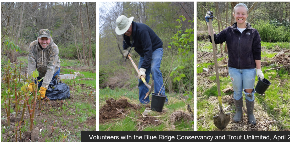
Volunteers with the Blue Ridge Conservancy and Trout Unlimited, April 2016

With only three full-time maintenance staff, the VCCC maintains a huge property with 19 separate lodging, meeting, and work spaces. Work of this nature from our community partners enables us to protect the natural beauty, native species, and wild sacredness of this place for future generations.