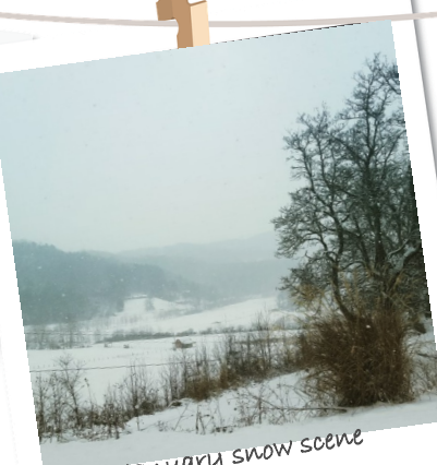
January snow scene