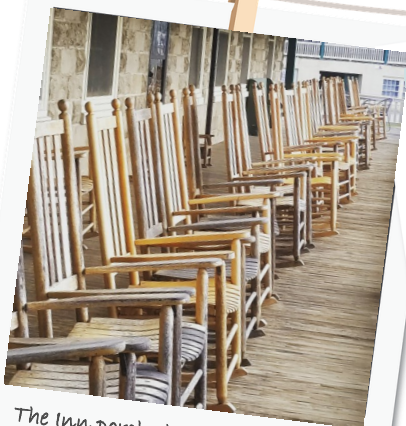
The Inn porch chairs glowing in the February sunlight