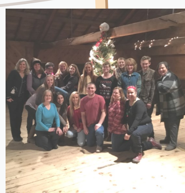
Mast Store Annex holiday party

Find more information about our programs and register quickly and securely online at www.vcconferences.org or complete and mail the form at the end of this newsletter.